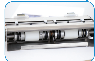
Heavy-duty cutting cassettes are interchangeable in seconds