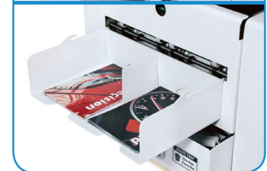
Adjustable catch tray keeps cards neatly stacked