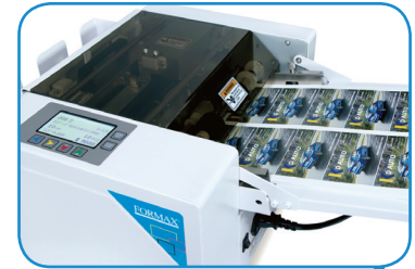
Automatic friction feed system and interlocking plexi cover