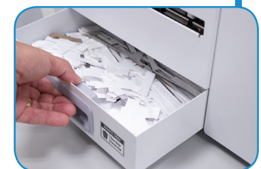
Waste bin collects paper scraps and is easy to empty

Formax - New Hampshire, USA www.formax.com