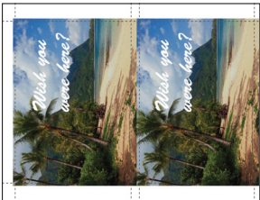
2-up 5" x 7" postcards Optional FC-10 - 7" Cassette