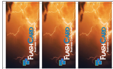
3-up 4.25" x 8" postcards Optional FC-20 - 8" Cassette